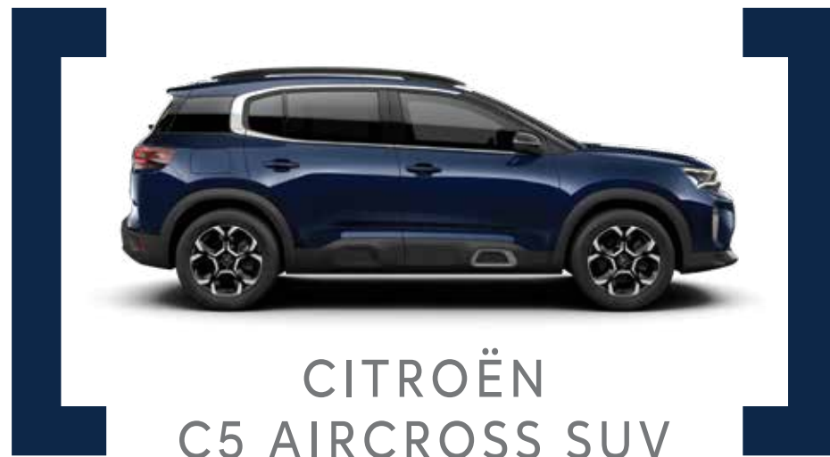
CITROËN C5 AIRCROSS SUV