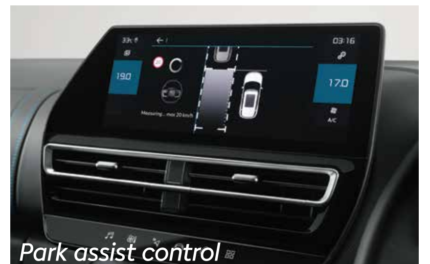
Park assist control