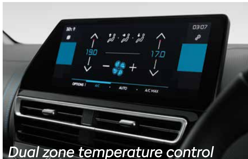
Dual zone temperature control