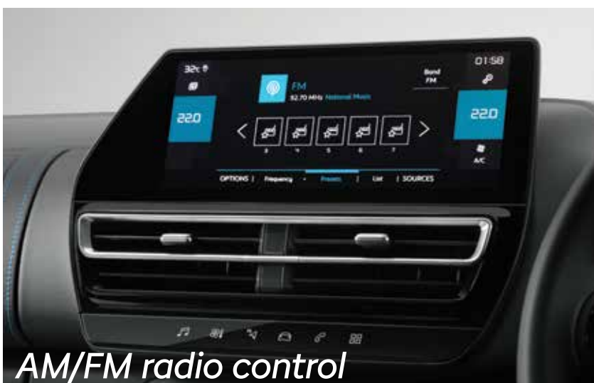
AM/FM radio control

The new 25.4cm (Shine variant) or 20.32cm (Feel variant) high-definition gloss black capacitive touchscreen is responsive and intuitive, enabling easy access to enjoy the features of your smartphone and to stay connected with it on the road. This smart screen also offers the controls for Dual Zone Temperature system, Reverse Camera input and the unique Coffee Break Alert. In addition, it controls the unique Park Assist feature for Parallel and Perpendicular parking with Automatic Steering control.