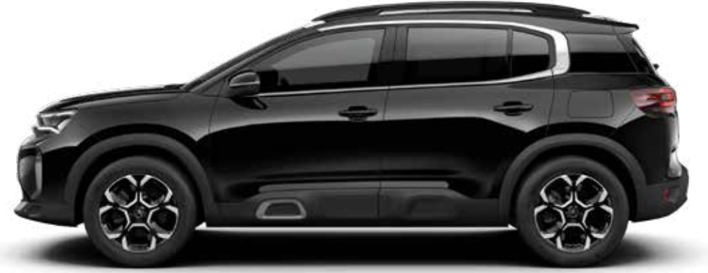
PEARL NERA BLACK