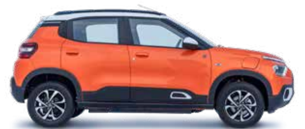
NEW ë-C3 ALL ELECTRIC